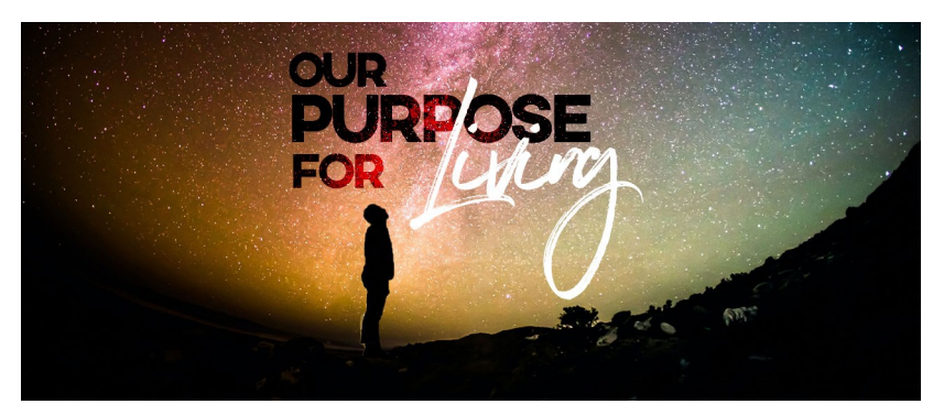
Loving God by Loving Others November 12 & 13, 2022

Purposes 1 and 2 (GRace) – We are here to <u>Glorify</u> God by building <u>Relationships</u> with others.